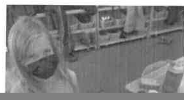
Grade 2, Orrin