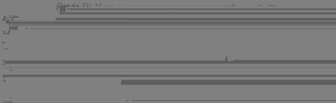
Grade 2, Sage